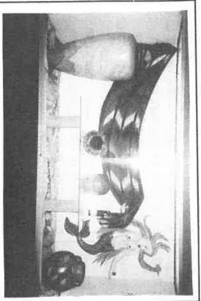
PNE DISPLAY BY CAROLINE FLACK

The Explorations Program offers project grants in support of innovative approaches to artistic creation and new developments in the arts. The grants, which are intended for artists in the early stages of their careers, professional artists who are changing disciplines, and new arts organizations, may be used for the creation of work in any arts discipline, drawn from any cultural tradition. An important aspect of the Explorations Program is the recognition of the regional, cultural and artistic context in which artists wish to develop their skills and ideas. Based on a regionally structured assessment process, the Program mirrors many of the developments and trends taking place in the different arts communities throughout the country.